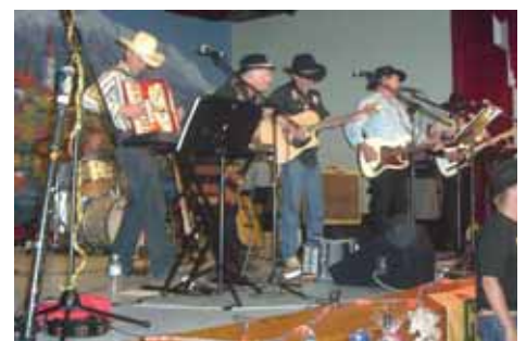
The CowboyZ on stage