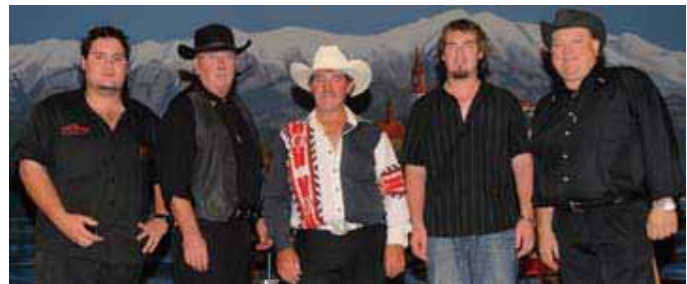
Murray Mac & True Grit