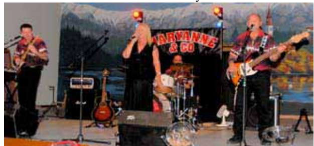
Maryanne & Co