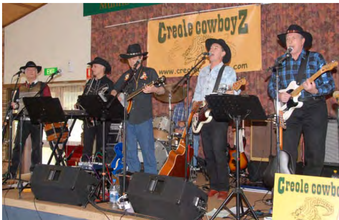
The BoyZ at the Gawler Country Music Club in July.