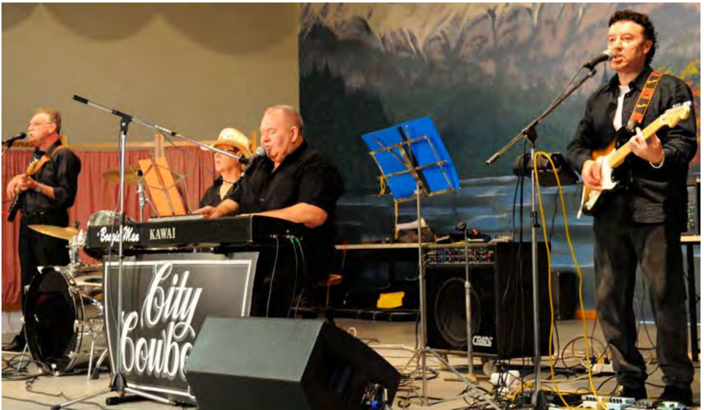
July show photos