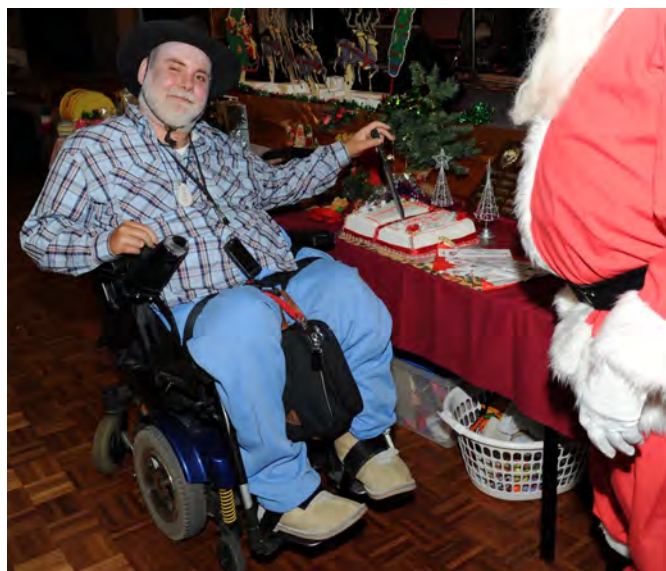
Right:- Wombat cutting our Xmas cake (baked by Joy Champion - thanks Joy!)