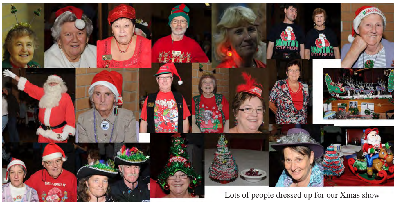
Lots of people dressed up for our Xmas show