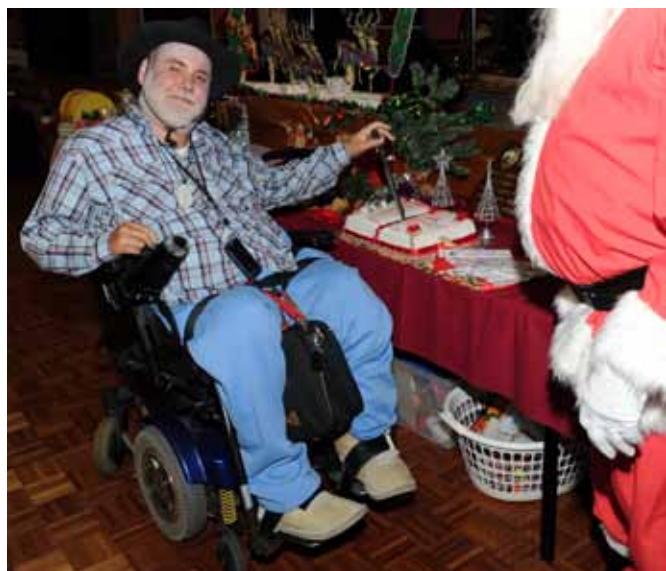
Right:- Wombat cutting our Xmas cake (baked by Joy Champion - thanks Joy!)