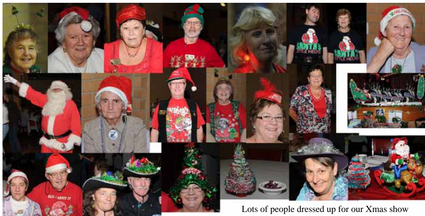
Lots of people dressed up for our Xmas show