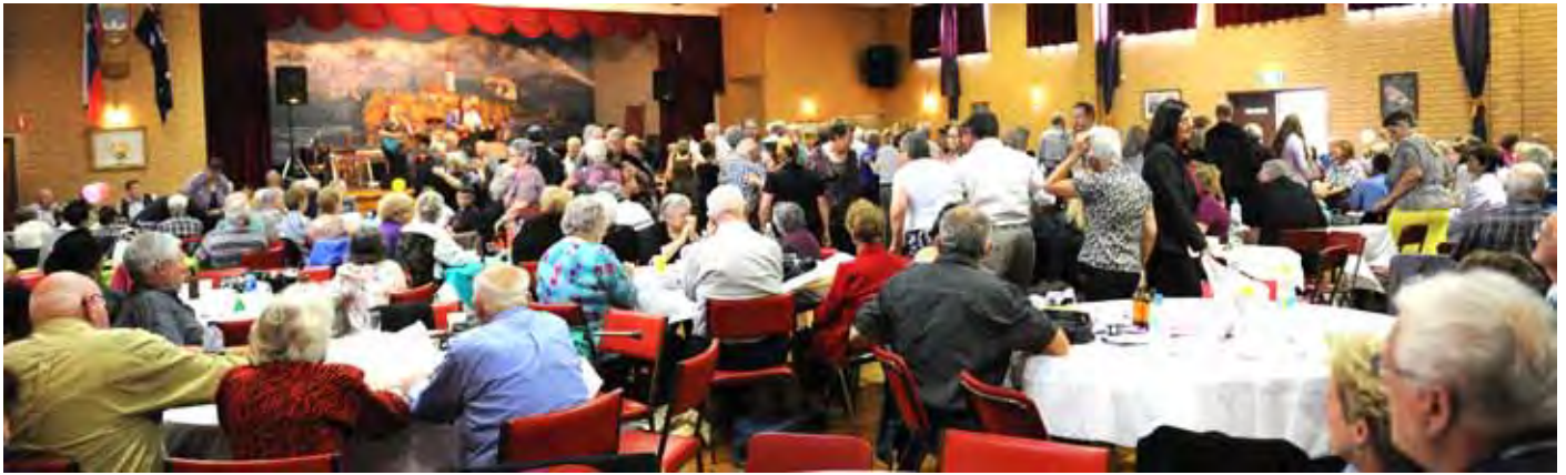
We had a record crowd at our February show!