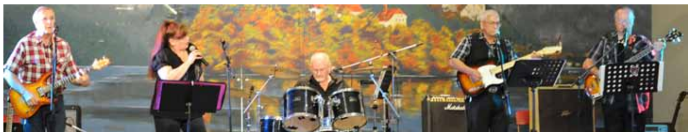
Mustang Country at our March show