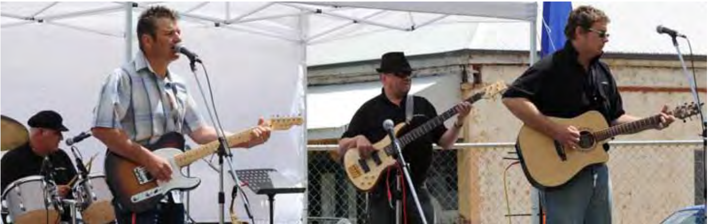
Outback Overdrive at the Murraylands Music Festival 2011