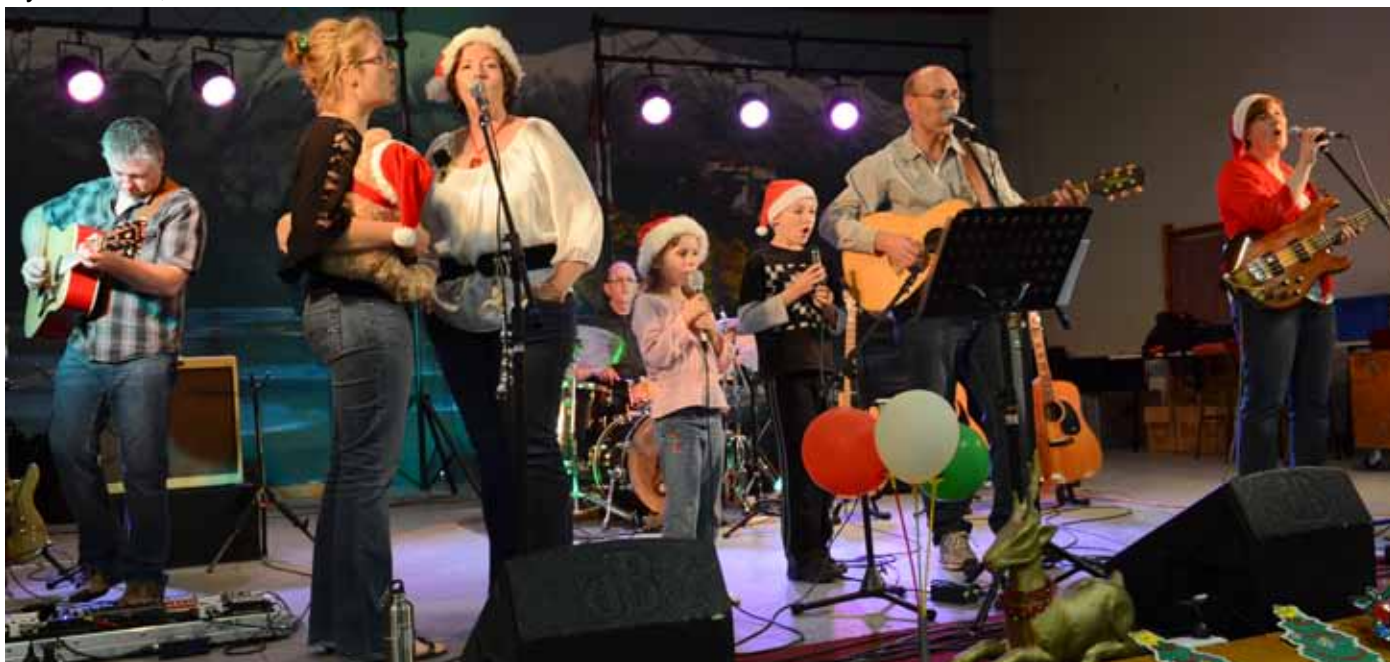
The Sherrahs plus children