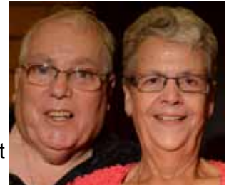
celebrated their 48 th