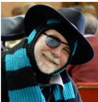
Left:- Wombat looked happy wrapped in his Port Adelaide scarf at our July club day!