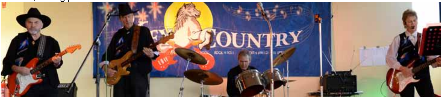
Key Country at Laura in July this year

The band has four albums available, hoping to get another album out soon!!!