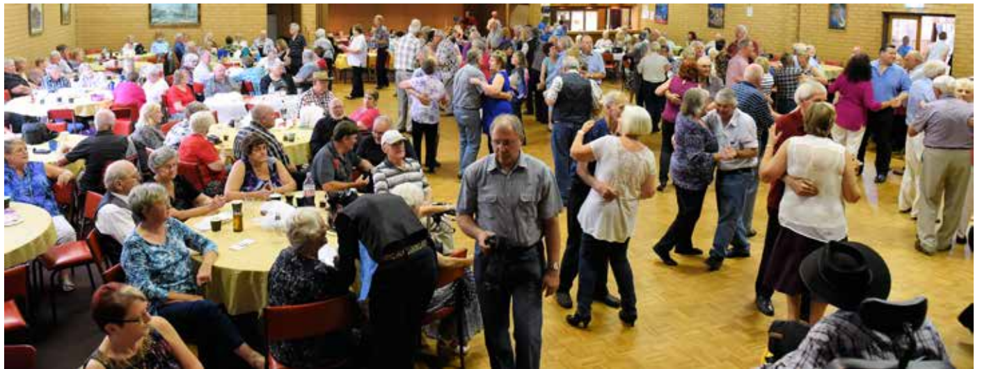
there was a good attendance at our January meeting