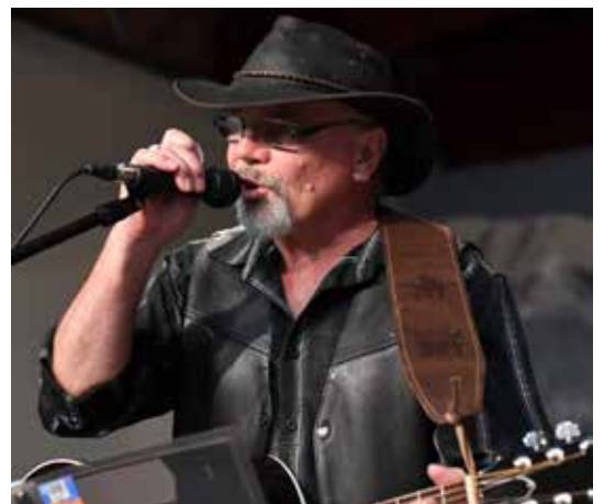
Right:- Paul Walker