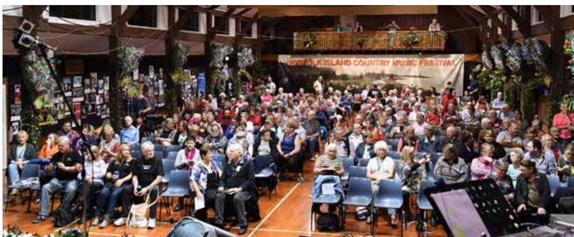
A Norfolk Island Country Music Festival audience view from the stage in Rawson Hall

This sign is taken out and back from Pym Street every meeting day.