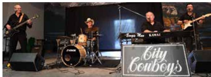
The City Cowboys at our December 2016 show