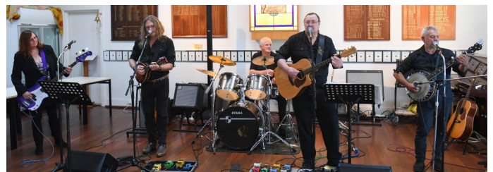
The band at the Plympton & Glenelg RSL, Plympton Park where they play on the 4 th Sunday every month