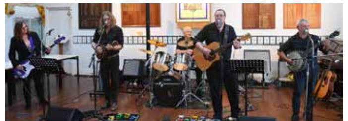
The band at the Plympton & Glenelg RSL, Plympton Park where they play on the 4 th Sunday every month