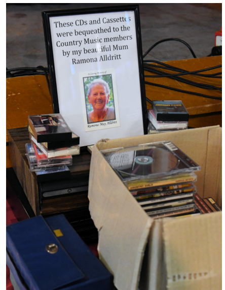
Above: CDs and Cassettes bequeathed to the Country Music members by Ramona Alldritt. A CD player was also bequeathed.

All items were soon picked up by our September Attendees.