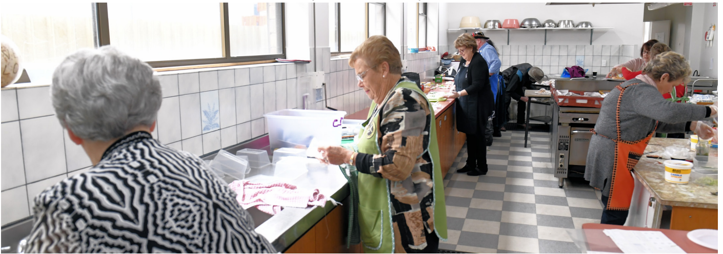
Hardworking volunteers and committee members preparing lunch.