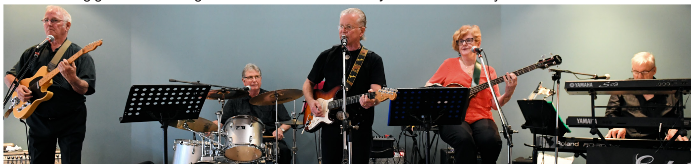
The band at the Rail Road Country Music Club March 2017