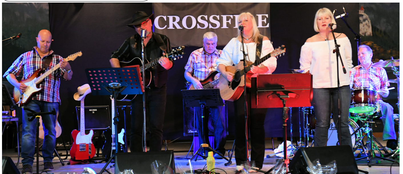
Paul Walker backed by Crossfire