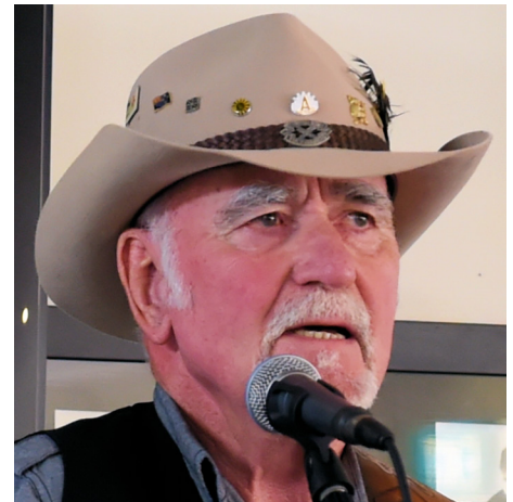
Photo taken at the 2015 Minlaton Country Muster