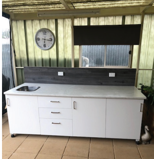
Dean's outdoor kitchen showing some of the paving

As we haven't had a meeting for a while, there are no new photos! check last year's issue!