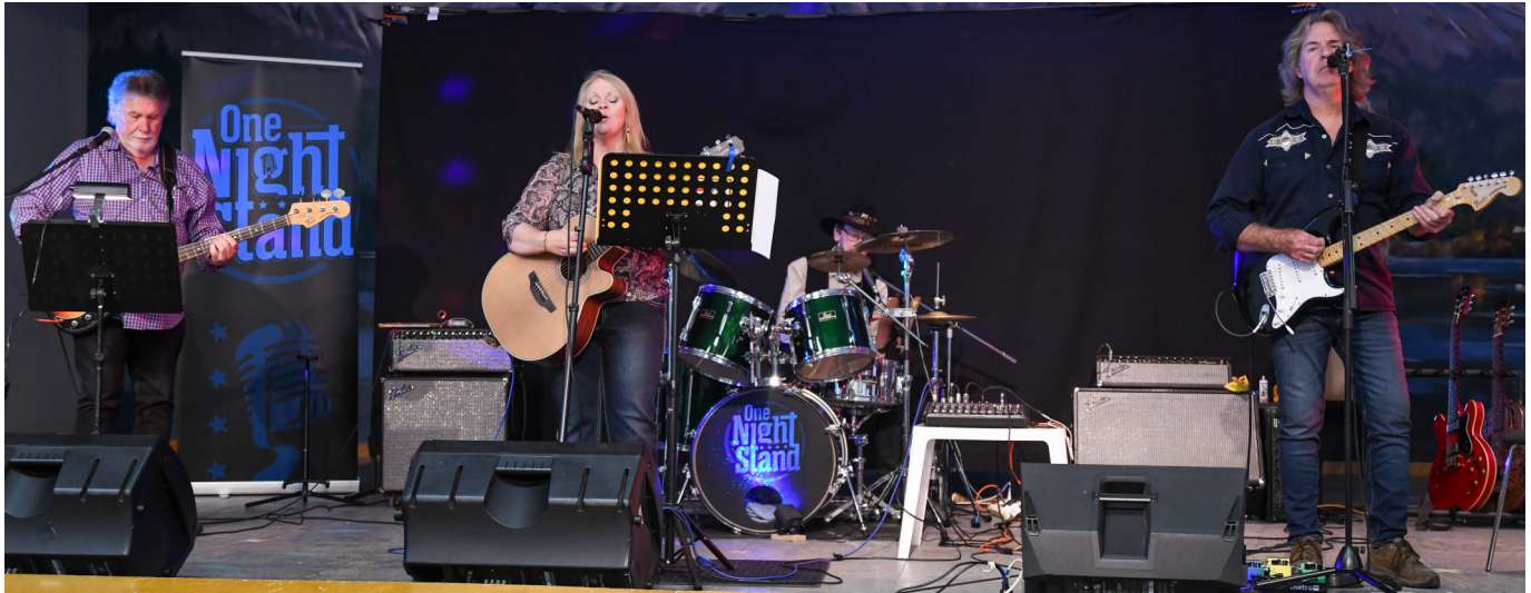
One Night Stand at our March show