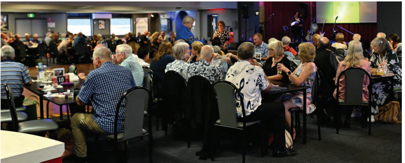
some of the audience at our March Club Day