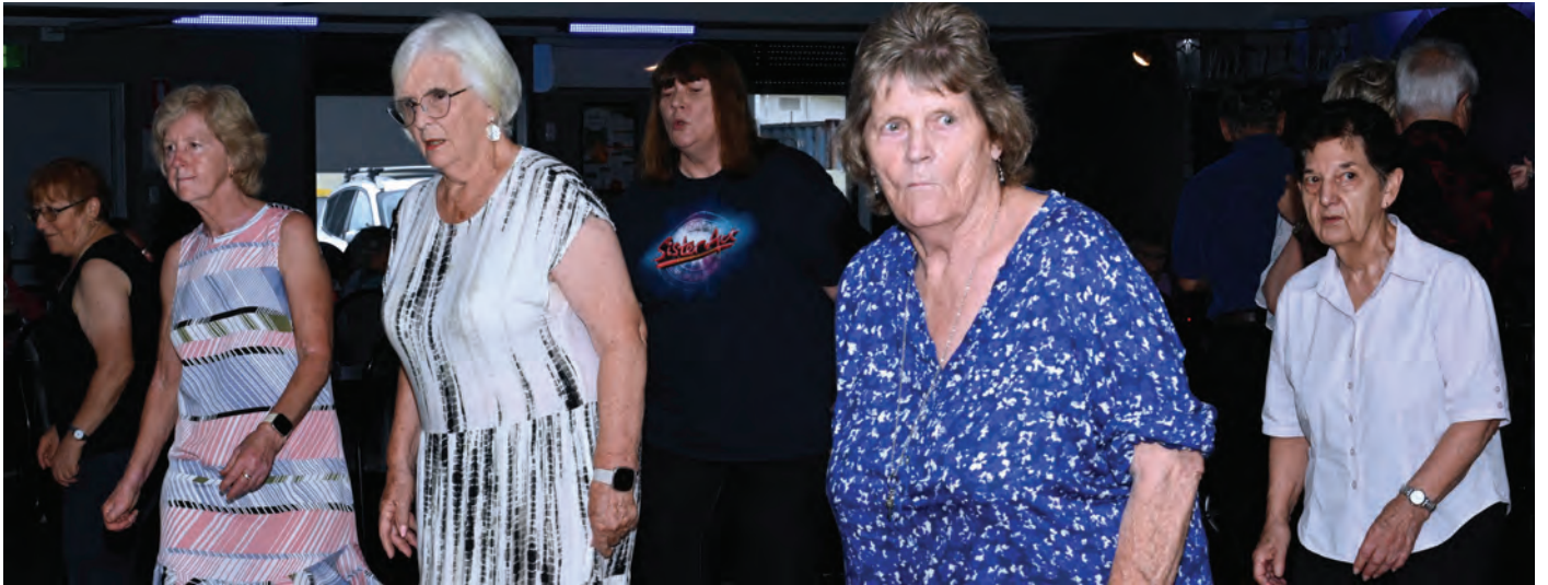
Dancers at our March Club Day